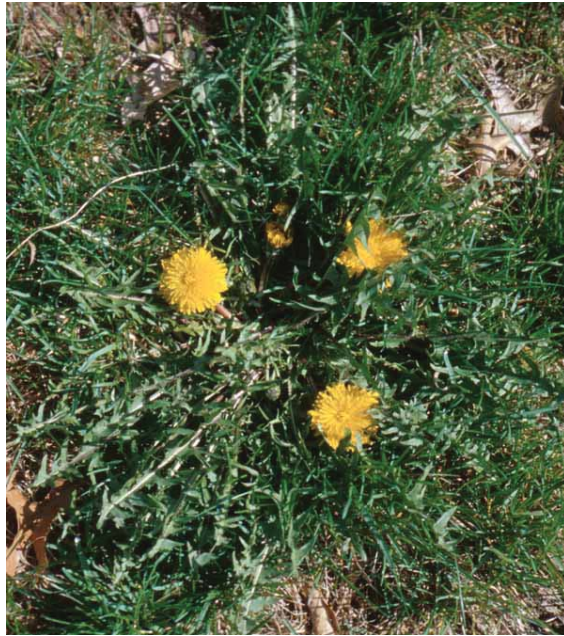
Figure 1. Dandelions are the most common weed in lawns, but they can be controlled with good cultural practice and fall applications of herbicides.

follow all directions on the herbicide label.